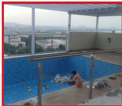
Rooftop Swimming Pool