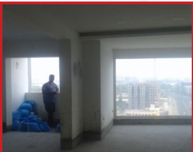
Gymnasium - Internal painting completed