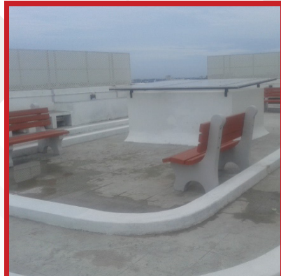
Rooftop Jogging Track