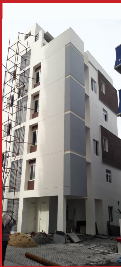
Block B - Completed