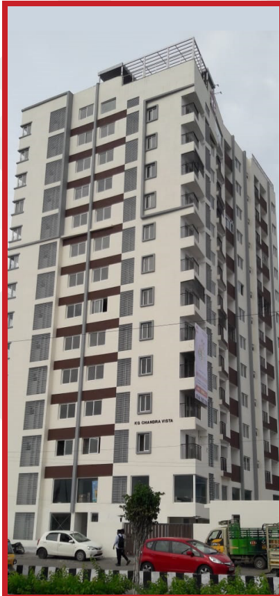
Block A - Completed