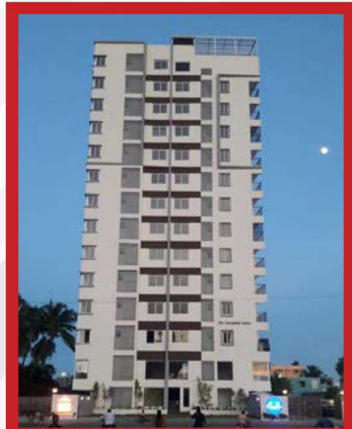
Evening view from OMR