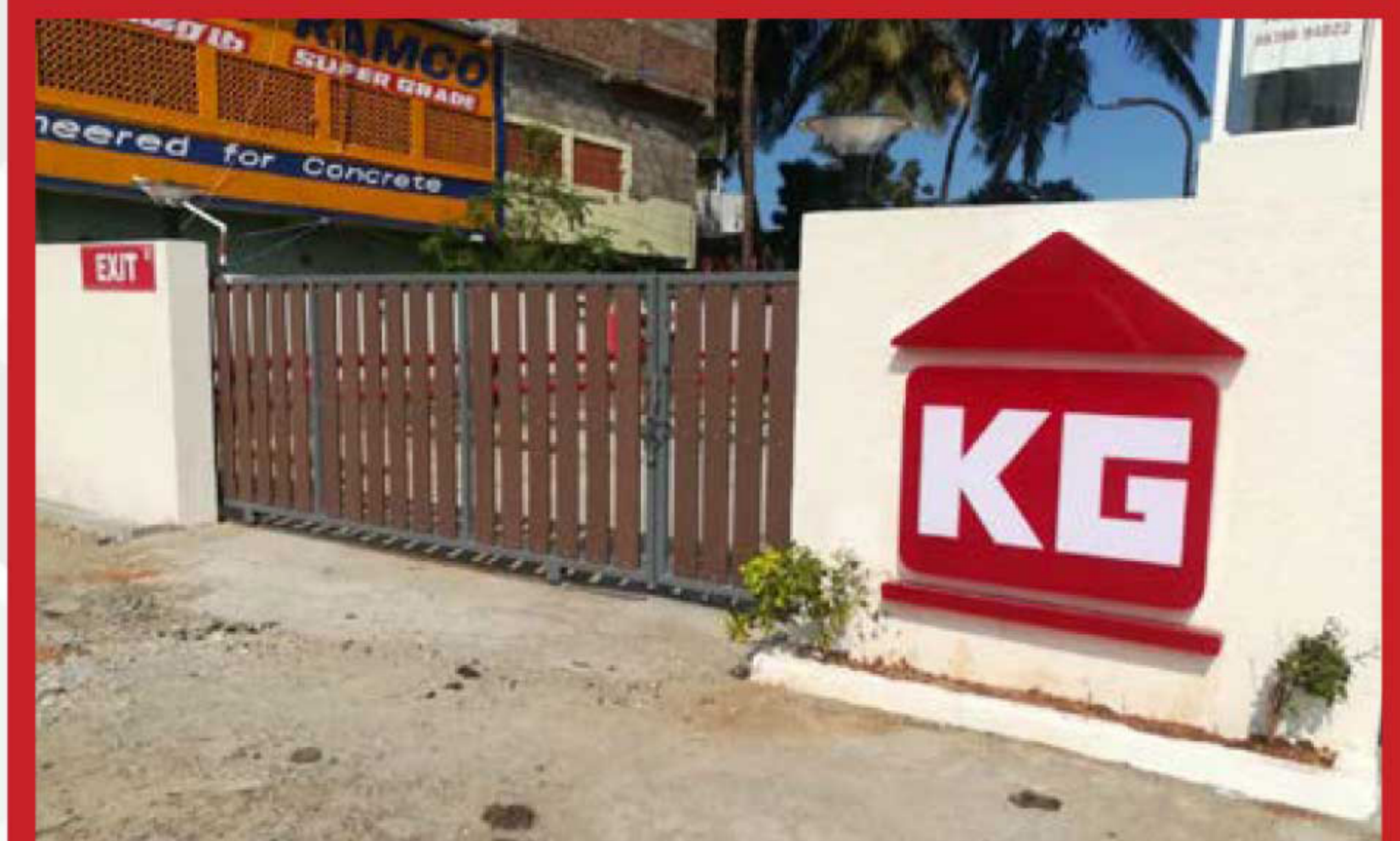
Logo Signage Installation: Completed