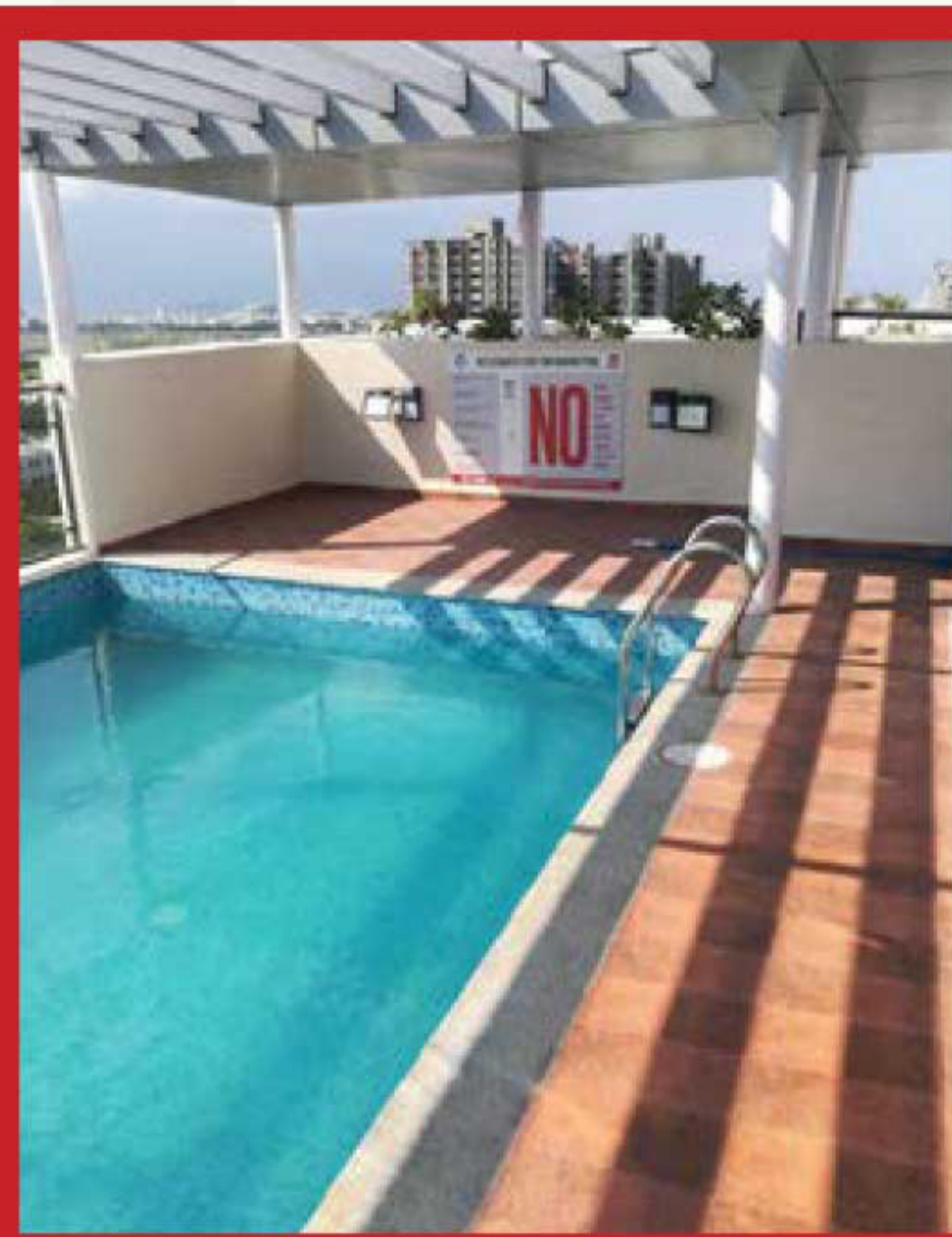
Signage Installation: Completed