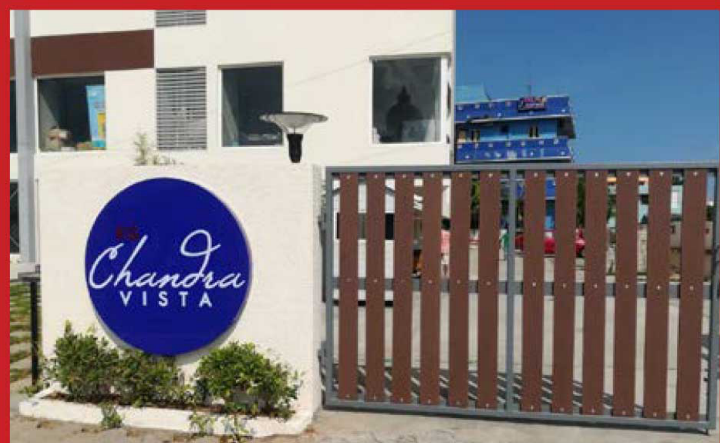
Logo Signage Installation: Completed