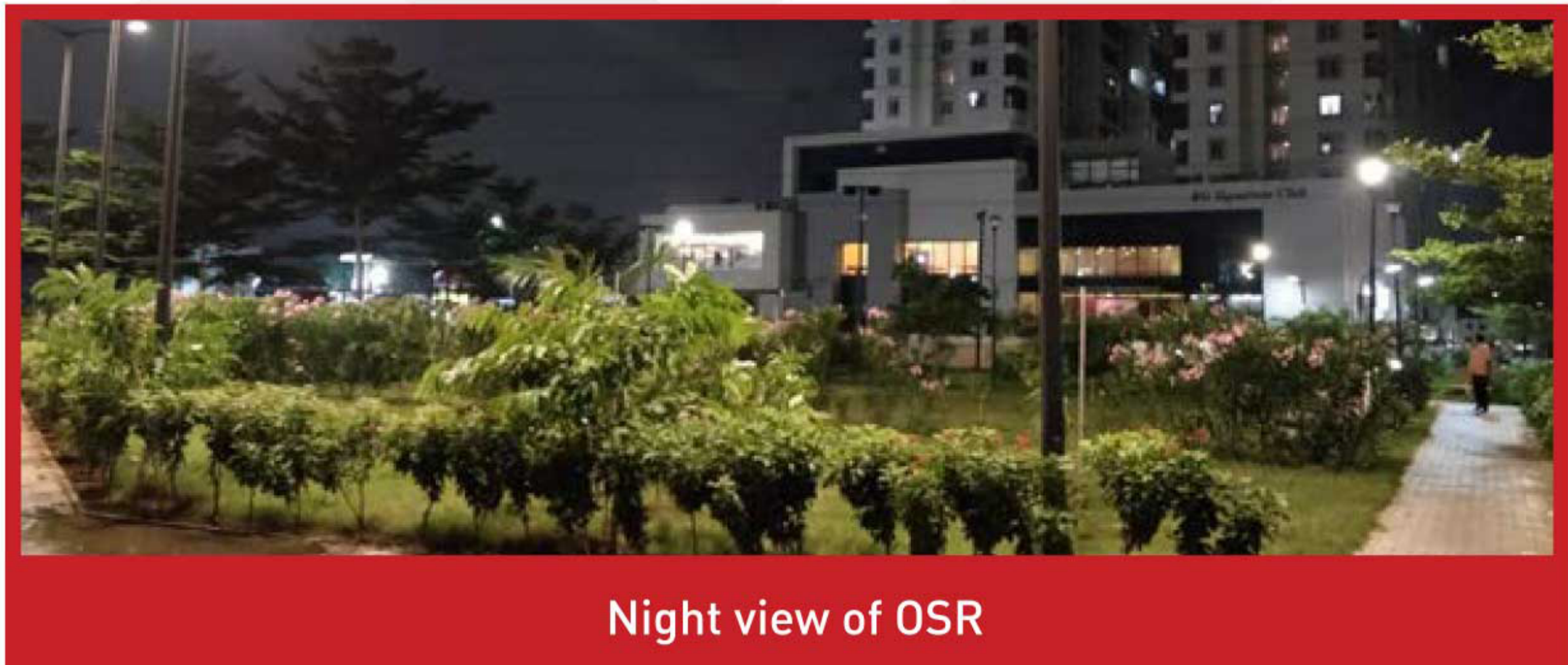
Night view of OSR