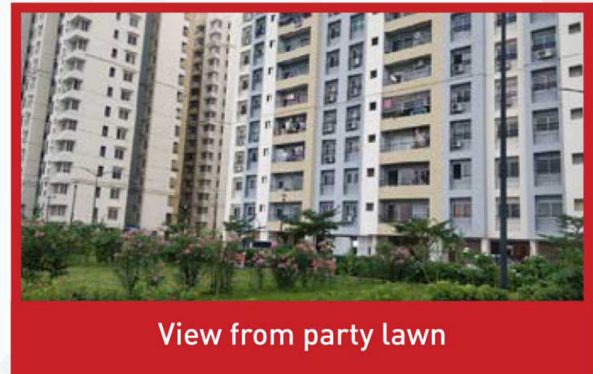
View from party lawn