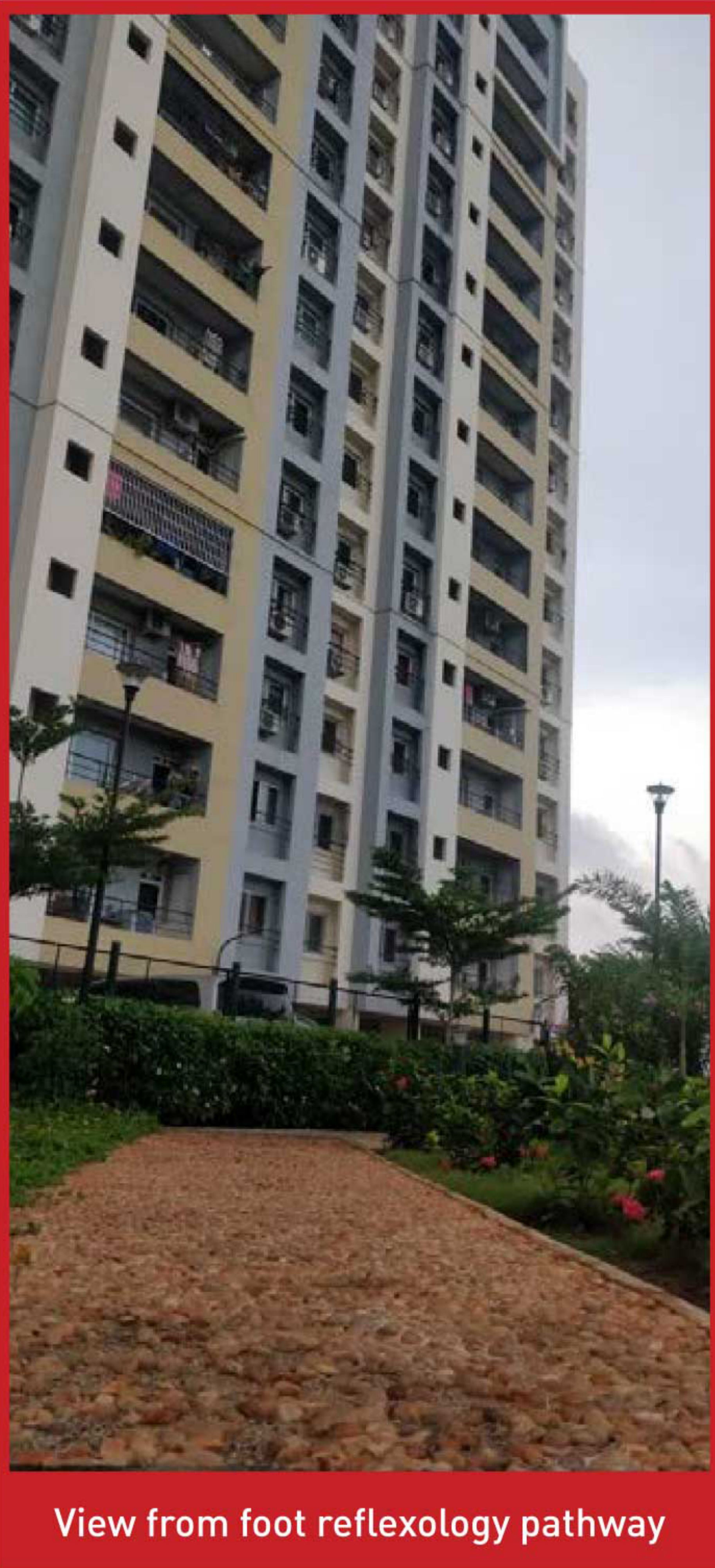
View from foot reflexology pathway