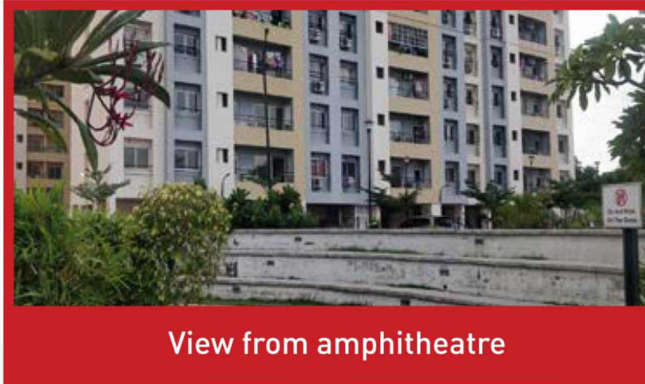
View from amphitheatre