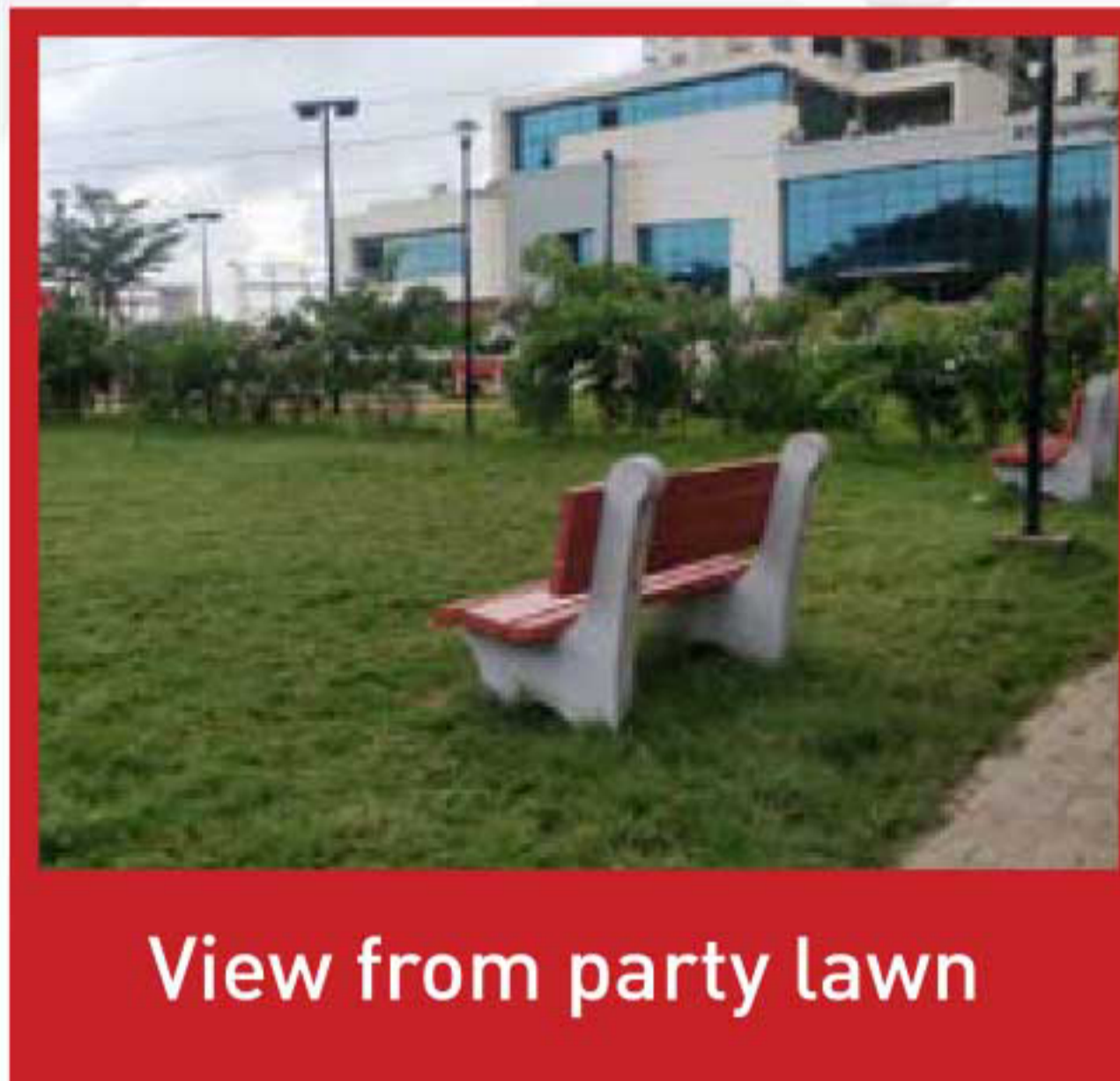
View from party lawn